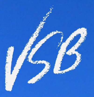
Engaged Learners Inclusive Schools Caring Communities